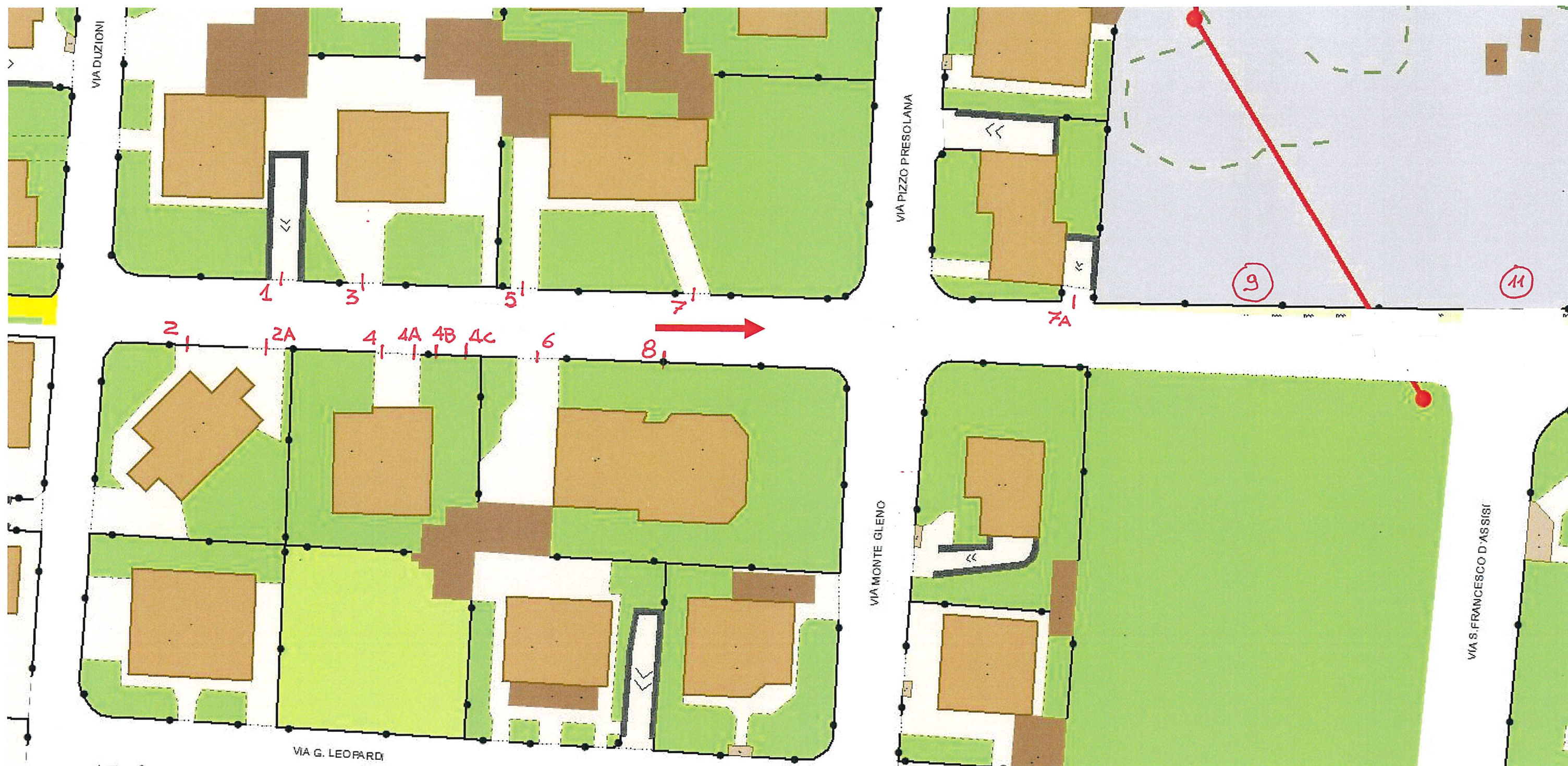
PLANIMETRIA VIA PIZZO CAMINO – 1° TRATTO