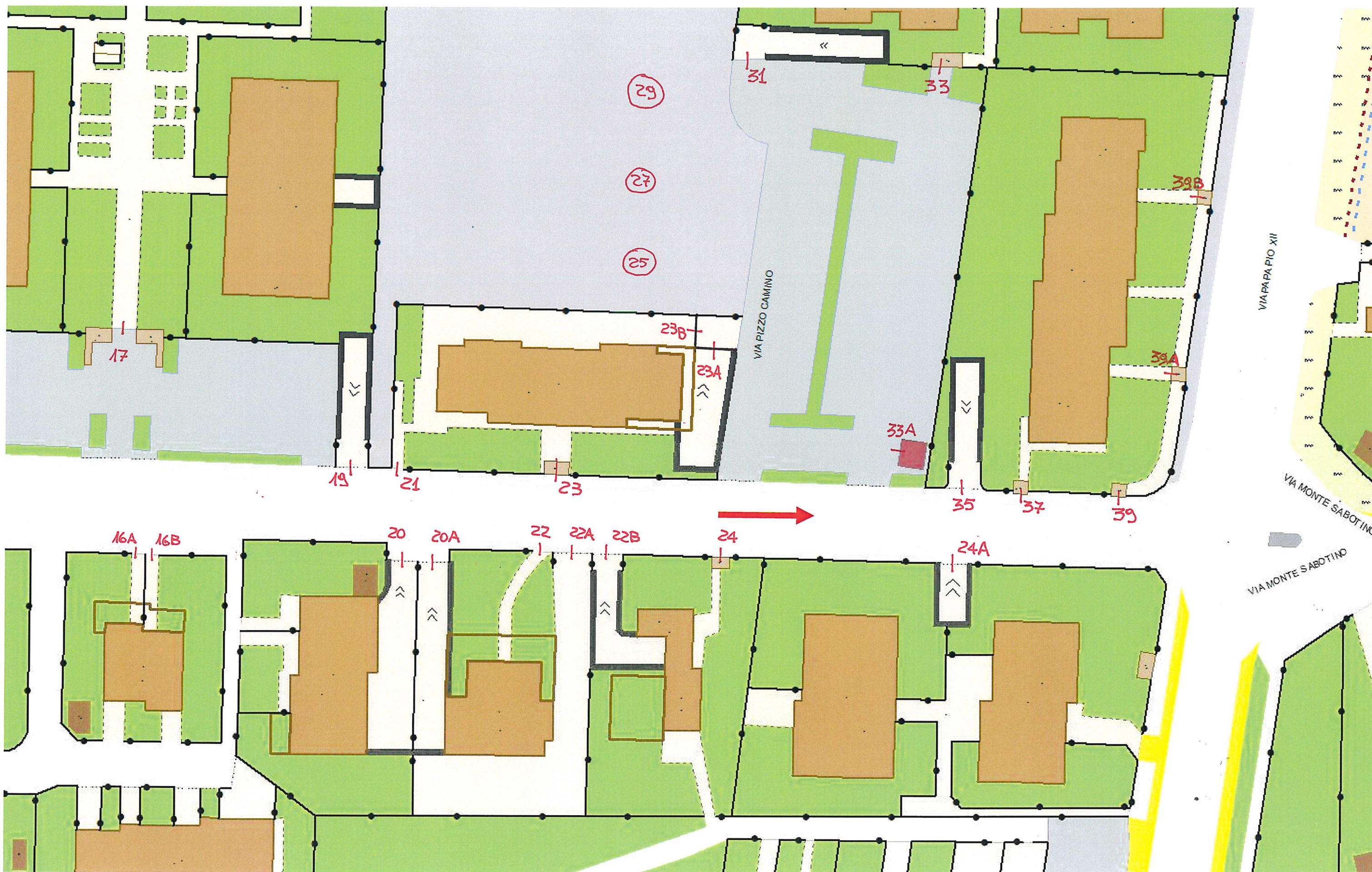
PLANIMETRIA VIA PIZZO CAMINO – 3° TRATTO