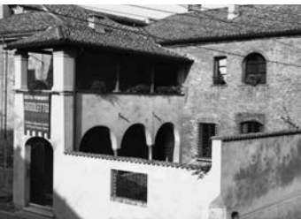
Mantua. Rigoletto's House, Studio Calzolari 1950-65 (Mantua, Photo library of the Baratta Library/ Media Library, Tourist Promotion Fund, APT 290)

Although its position is not the one that can be deduced from the description provided by the libretto (... Gilda resided “in a quiet back-alley (in un remota calle)” at “the most deserted end of a cul-de-sac (all'estremità più deserta di una cieca via)” ...), the court jester's house was identified with the current Rigoletto's House in Piazza Sordello. In fact, the dwelling is the only remaining example of a typical two-storey building with a fenced garden, characteristic of Renaissance Mantua, which curiously corresponds to the indications of Hugo and later Piave, as represented in the sketch of the scene by Bertoja. Moreover, the proximity of the house to the ducal residence seemed suitable for a person working at court, and in particular for a court jester. The current house has a small porch, evoked by opera lovers as the “balcony of Gilda”, which marks out a pleasant garden, in which stands the statue of Rigoletto, by the sculptor Aldo Falchi, placed here in 1978. The building is currently the seat of the tourist Infopoint “Rigoletto's House”.