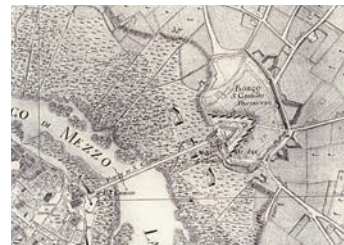
Detail of the borgo floorplan of San Giorgio based on an early 19th century map (Private collection).