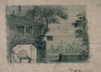
Giuseppe Bertoja, The most deserted dead-end street. Sketch for the first performance of Rigoletto (1.7). Pencil, pen and watercolor. Pordenone, Civic Museum "Ricchieri".

«Cortigiani, vil razza dannata, per qual prezzo vendeste il mio bene?» (Rigoletto) [scene four]