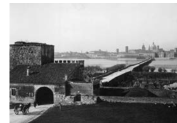
Mantua, Sparafucile's Rocchetta, on background the bridge of San Giorgio and the city of Mantua