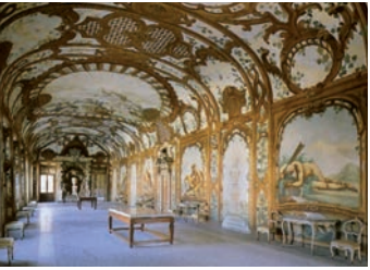
Palazzo Ducale Sala dei Fiumi