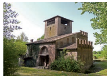
Mantua Sparafucile's Rocchetta

Sparafucile's inn may be ascribed to the current Rocchetta (stronghold) bearing the same name, that is remains of a fortification wall protecting the satellite village of San Giorgio since the late Middle Ages (as can be seen from the Bertazzolo chart of 1628) which, at the time when the opera was written, still served as a guard station and customs post. The Rocchetta has been partially restored, although it cannot be visited inside. The inn, the main set of act three and location where Rigoletto's curse took place, with the death of his daughter Gilda, is represented in a completely realistic manner: both Piave and Bertolucci imagined it distant and isolated from the public street as, indeed, it is currently.