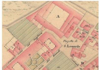
Mantua, church of San Leonardo, Teresian Cadastre, 1778, State Archives of Mantua. Detail

«Caro nome che il mio cor festi primo palpitare, ...» (Gilda) [scene thirteen]