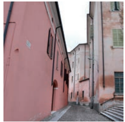
Vicolo Cappuccine District of San Leonardo

From the description by Piave, Rigoletto's house could be placed in the urban area bounded by the patrolled wall overlooking Middle Lake. The most authentic traces of the past documented by Bertazzolo can be found in the district of San Leonardo and precisely among the houses next to the former convent of the Capuchin nuns, an 18th century building situated in Square of San Leonardo, used as a military hospital during the Austrian domination.