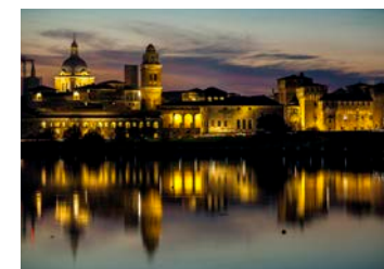
Mantua, view of the city.

The inn of Sparafucile is situated on the left bank of Middle Lake, one of the three lakes formed by the River Mincio, the dark and mysterious setting of the last dramatic events of the opera. From the lake shore we can also see the majestic and mysterious profile of the princely city that frames the whole drama of Rigoletto.